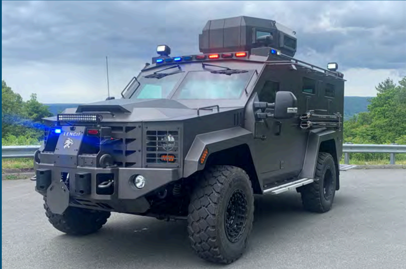
Armored Rescue Vehicle – Bearcat Vehicle #8881 Replacement Cost $370,000