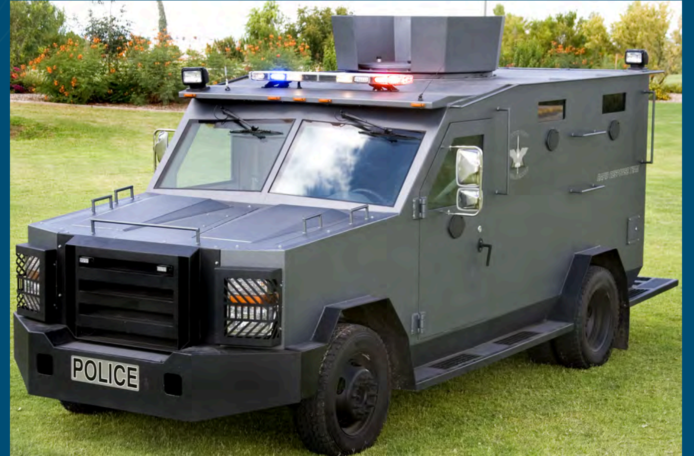
Armored Rescue Vehicle TK4 #08214 Replacement Cost $330,000