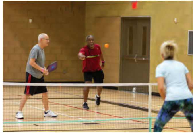
Pickleball is one of many activities offered at the Tumbleweed Recreation Center.

Enroll in person at the TRC. Present your identification at the time of registration. For more information, call TRC Guest Services at 480-782-2900.